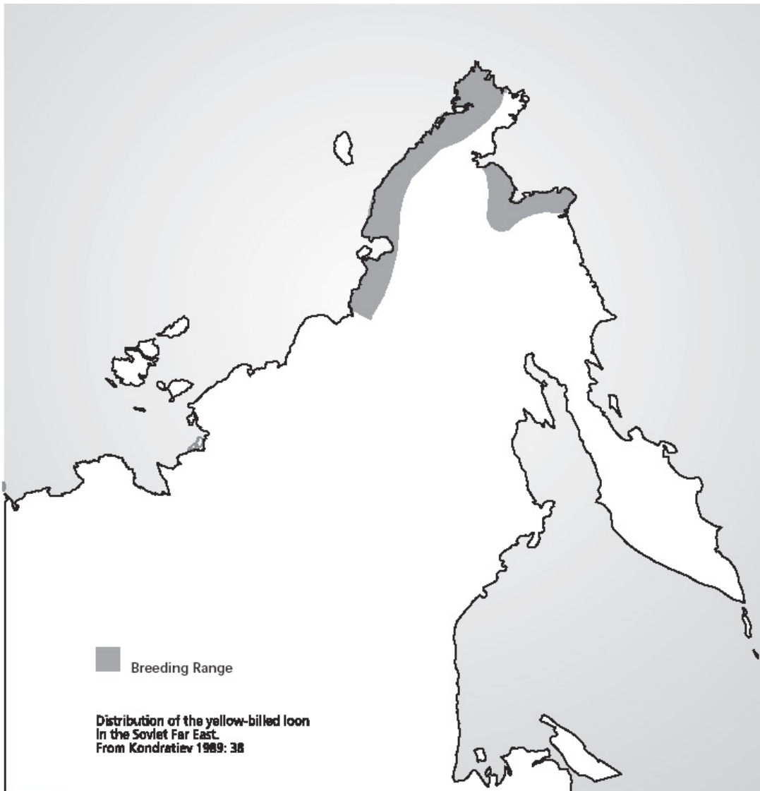
Figure 3: Distribution of the yellow-billed loon in the Soviet Far East.

Eurasian concentrations are reported only on the Chukchi and Taimyr Peninsulas of Russia (Knystautas 1993, Kondratiev 1989, Flint et al. 1984). Rogacheva (1992) reported the species rare throughout the Taimyr area, its total number low, and breeding confined to the peninsular area of the much larger Krasnoyarsk Territory. North (1994) referred to the incidence of yellow-billed loon breeding in the 2 areas as "common," likely in reference to much lower densities elsewhere, and not common in reference to waterfowl densities.