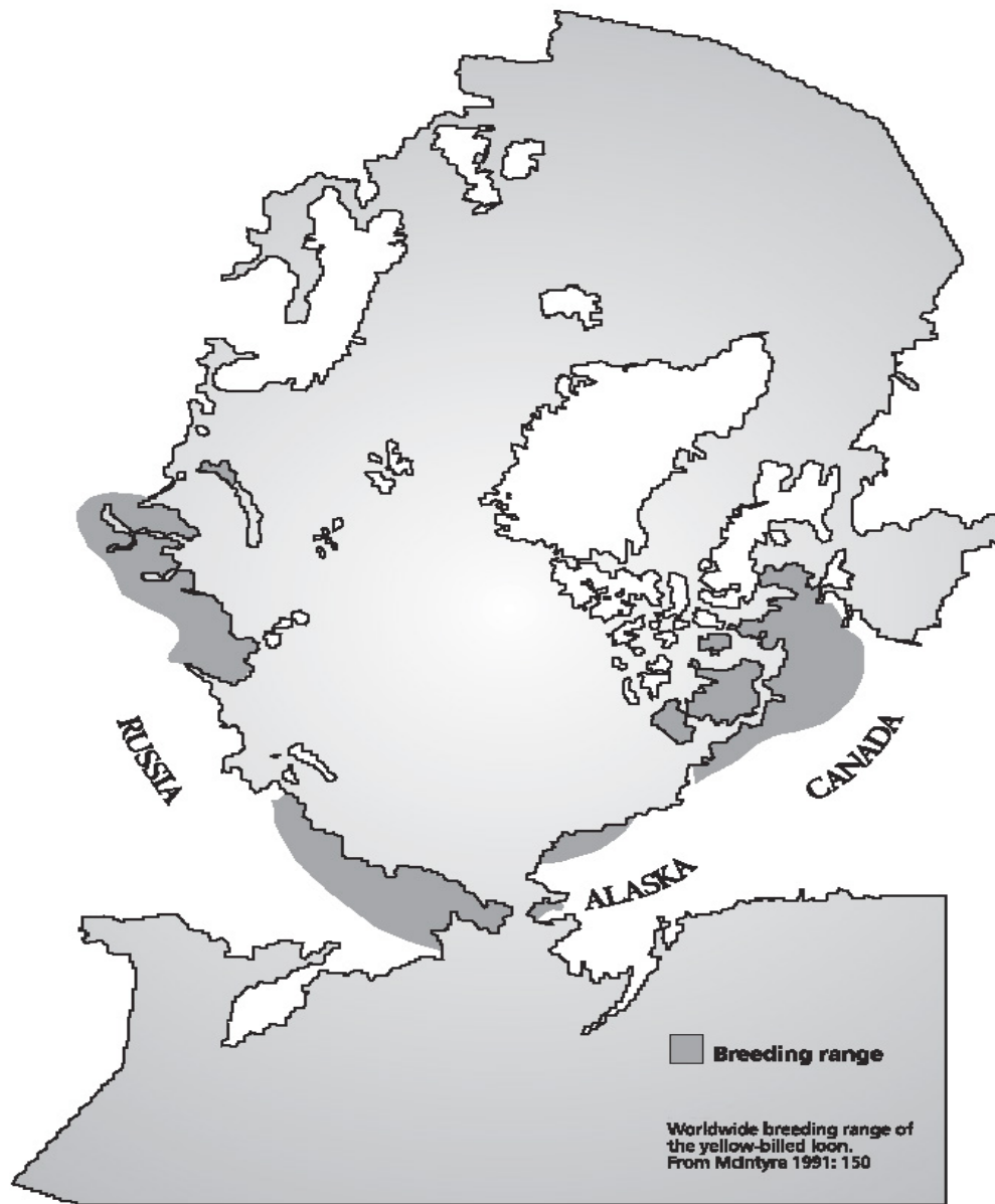
Figure 1: Worldwide breeding range of the yellow-billed loon.

Breeding grounds lie above 60° N (North 1994) although usually above 66° N (Stepanyan 1990, Kessel 1989). Yellow-billed loons currently breed or recently have bred in extreme northern Norway and Finland, arctic Eurasia to the Bering Sea, areas of Alaska's Seward Peninsula and arctic coastal plain, and areas of northwestern Canada west of Hudson Bay and Baffin Island (Barr 1997, North 1994, 1993, Knystautas 1993, Rogacheva 1992, Sibley and Monroe 1990, Kessel 1989, Godfrey 1986, North and Ryan 1986, Portenko 1981, Dementev and Gladkov 1967). Within breeding ranges, yellow-billed loon density is low, variable, and sporadic in Alaska (North and Ryan 1986), rare across the loon's breeding range, with distribution "extremely uneven" in Russia