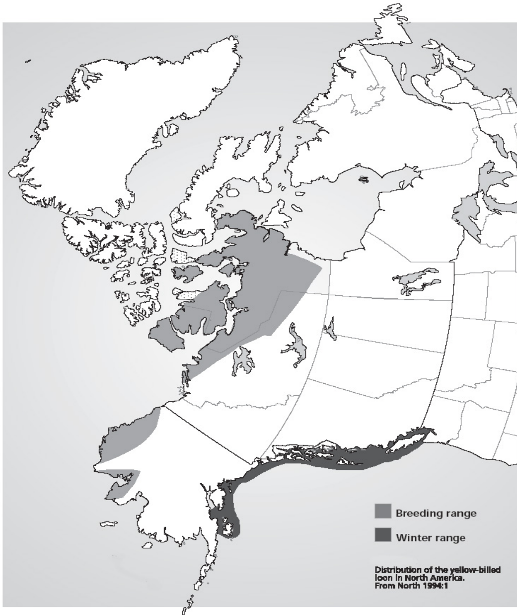
Figure 2: Distribution of yellow-billed loon in North America.

(Knystautas 1993, Rogacheva 1992, Perfilev 1987), and rare in dispersed areas in arctic Canada, Alaska, and Eurasia (North 1994, 1993). McIntyre (1991) suspected that worldwide breeding distribution may be more restricted than recent range maps would indicate. Occasional areas of concentration have been noted, but remain impossible to predict by habitat type (Earnst 2000b, McIntyre 1991).